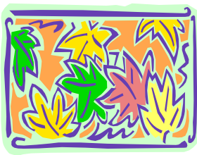
Autumn Leaves are Falling!

Again, we are asking that parents direct their children to wash their child's hands upon arrival to school each day. Teachers are very busy at this time of day and find it hard to remind everyone.